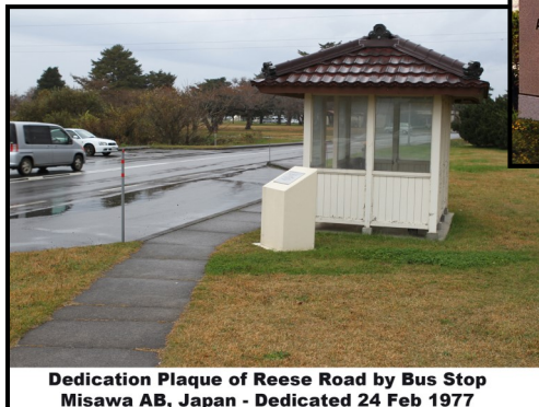
Dedication Plaque of Reese Road by Bus Stop Misawa AB, Japan - Dedicated 24 Feb 1977