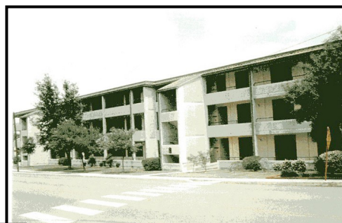
Leftwich Dormitory - Kelly AFB, TX