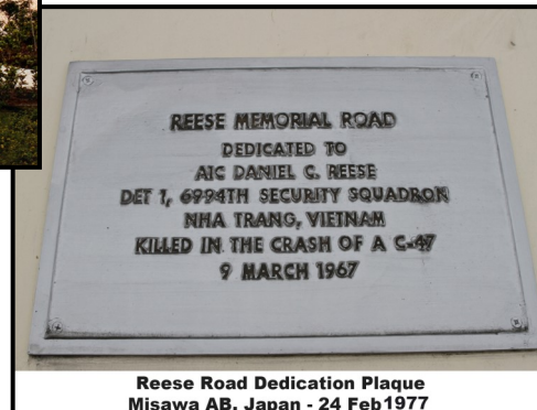
Reese Road Dedication Plaque Misawa AB, Japan - 24 Feb 1977