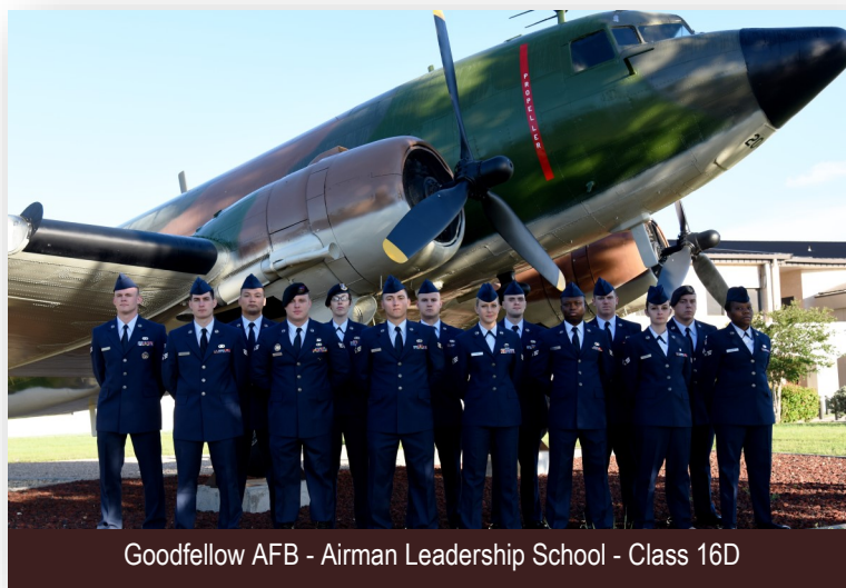
Goodfellow AFB - Airman Leadership School - Class 16D

The error message "unable to connect" when trying to get on the archive.ec47.com website reported in our last edition has not been reported since. Thanks for your inputs, and please don't ever hesitate to notify us at info@ec47.com if you note any website difficulties, broken links or other errors. Thanks.