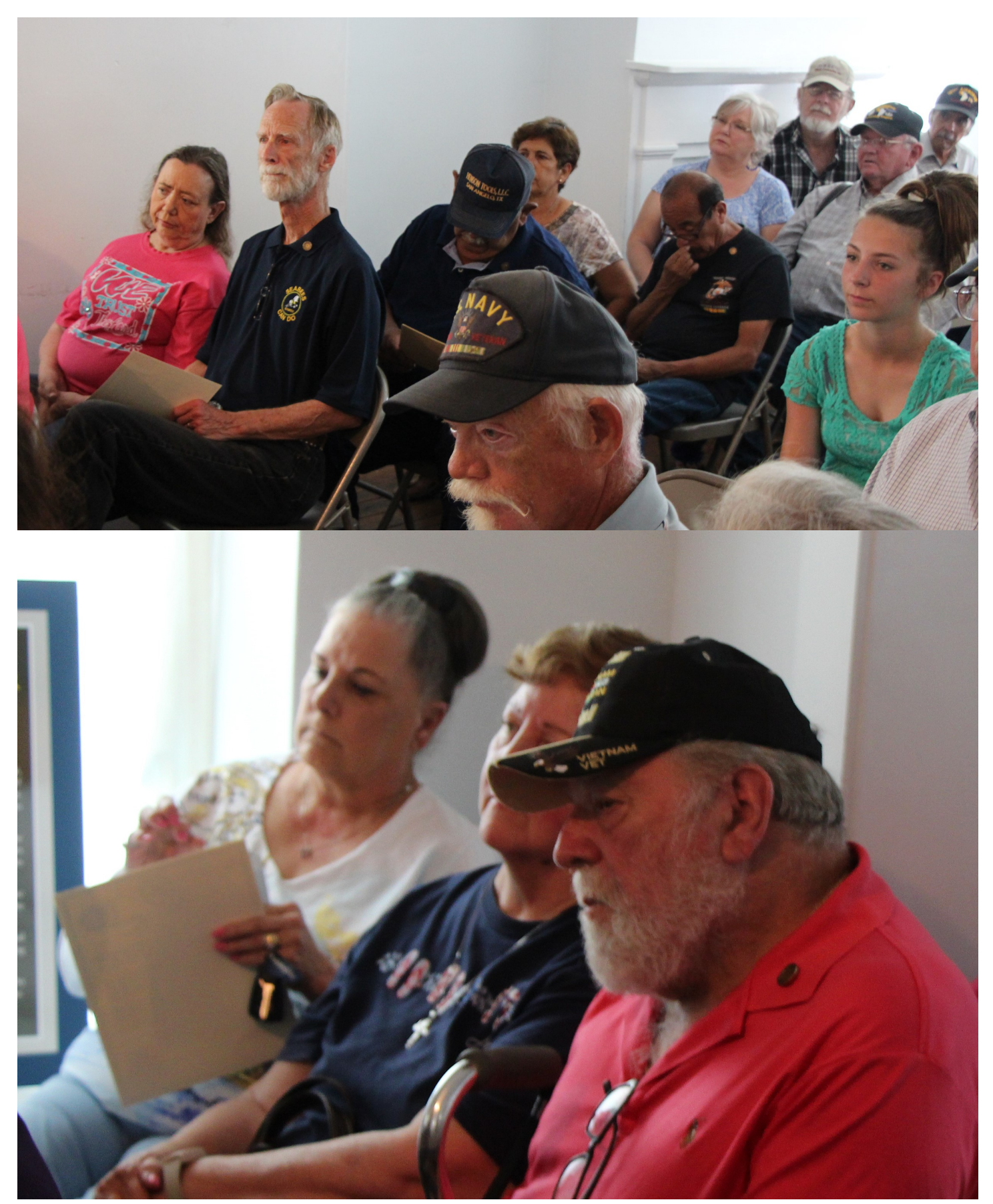
Vietnam War era veterans and their families listen to closing remarks following the lapel pin and certificate presentation ceremony hosted by the All Veterans Council of Tom Green County at Fort Concho, San Angelo, Texas, on June 18, 2016.