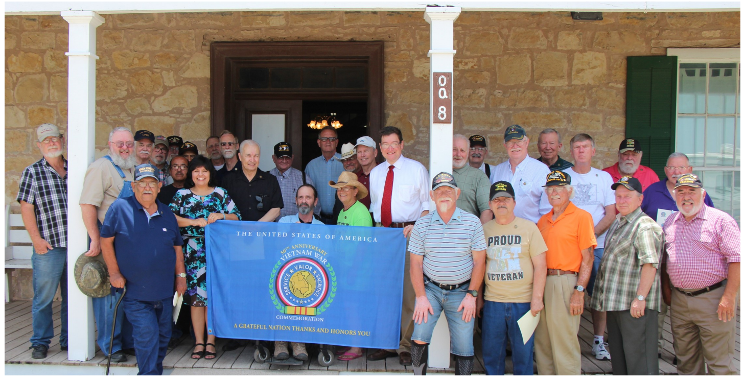
Above: The twenty-seven Vietnam War era veterans and event organizers pose for a group photograph following the 50th Vietnam War Commemoration ceremony hosted by the All Veterans Council of Tom Green County at Fort Concho, San Angelo, Texas, on June 18, 2016.

Above: Vietnam War era veterans share their individual "war stories" after the group photo was taken during the commemoration event hosted by the All Veterans Council of Tom Green County at Fort Concho, San Angelo, Texas, on June 18, 2016.