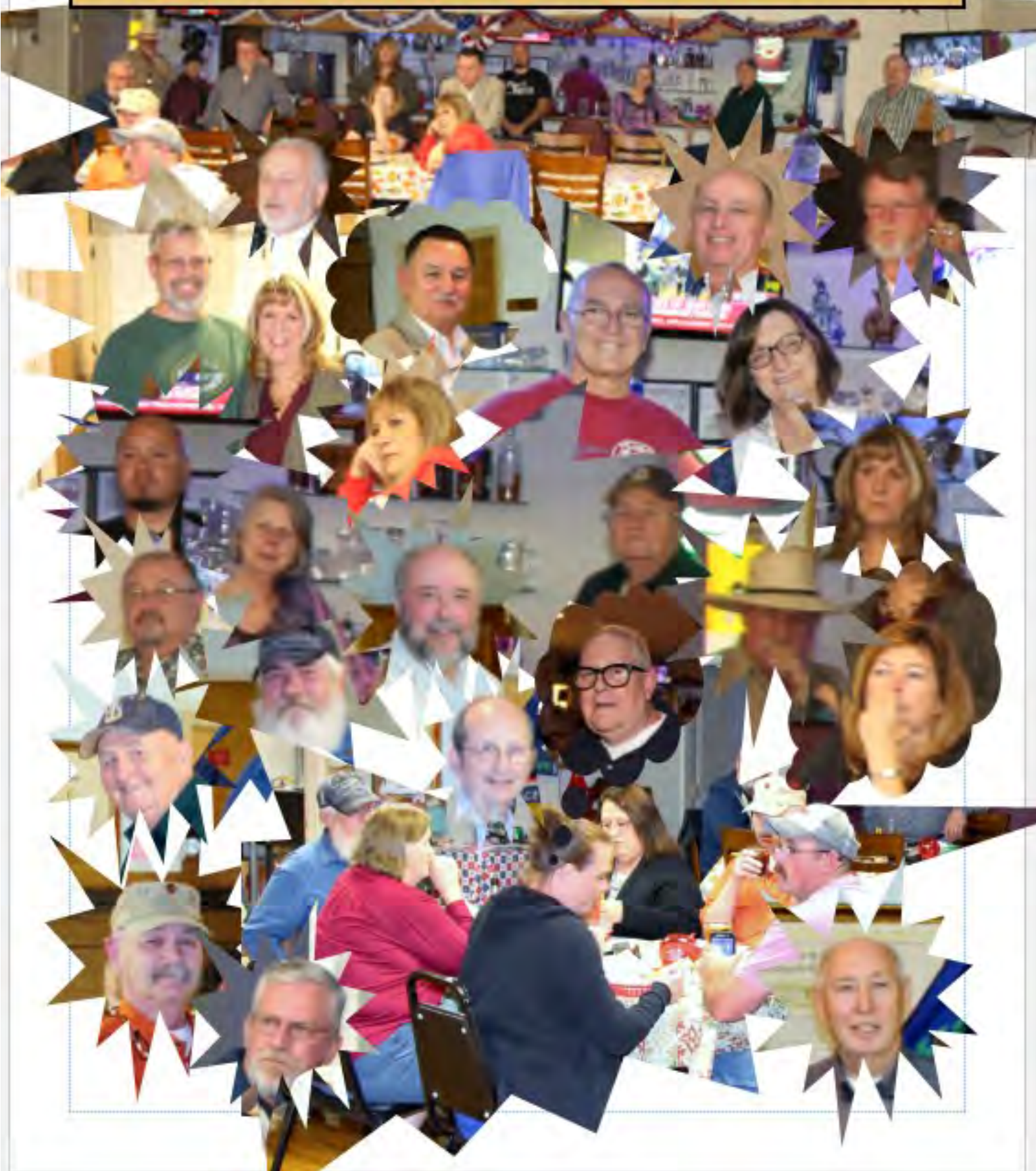
Photo collage of Vietnam War-era veterans, their families and friends gather at the Elks Lodge for the Vietnam War Commemoration Ceremony.