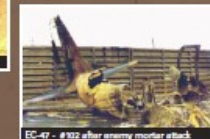
EC-47 - #102 after enemy mortar attack