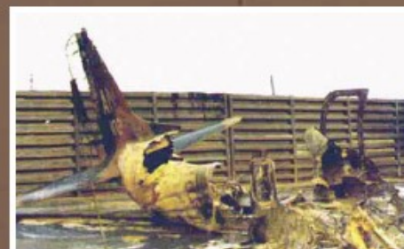
EC-47 - #102 after enemy mortar attack