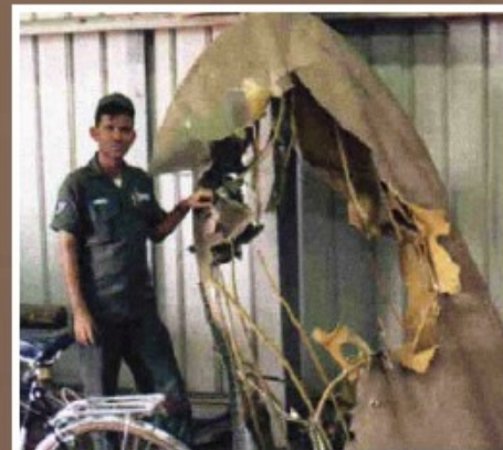
EC-47 - #029 wingtip anti-aircraft artillery damage