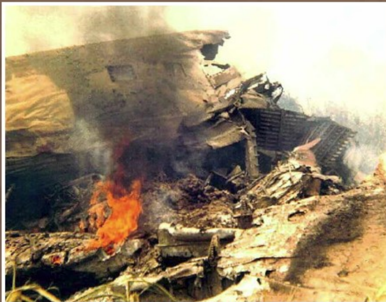
CAP-53 crash site after aircraft destroyed by U.S. airstrikes - April 22, 1970