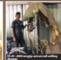
EC-47 - #529 wingtip anti-aircraft artillery damage