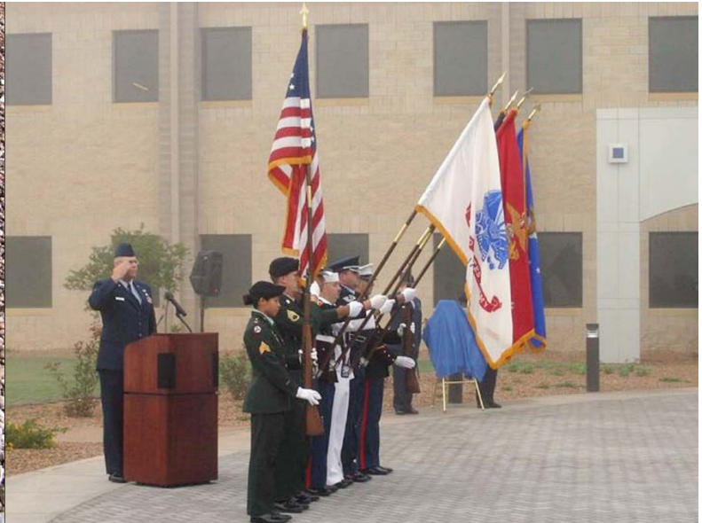
Figure 3: All services Color Guard presents Colors to open dedication ceremony