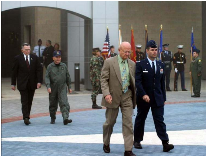
Figure 4: Front Left –Lt. Gen. (R) James Clapper, Jr., leads VIP guests