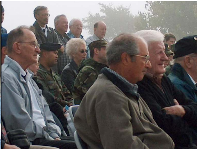
Figure 5: Vietnam Veterans & guests attending dedication