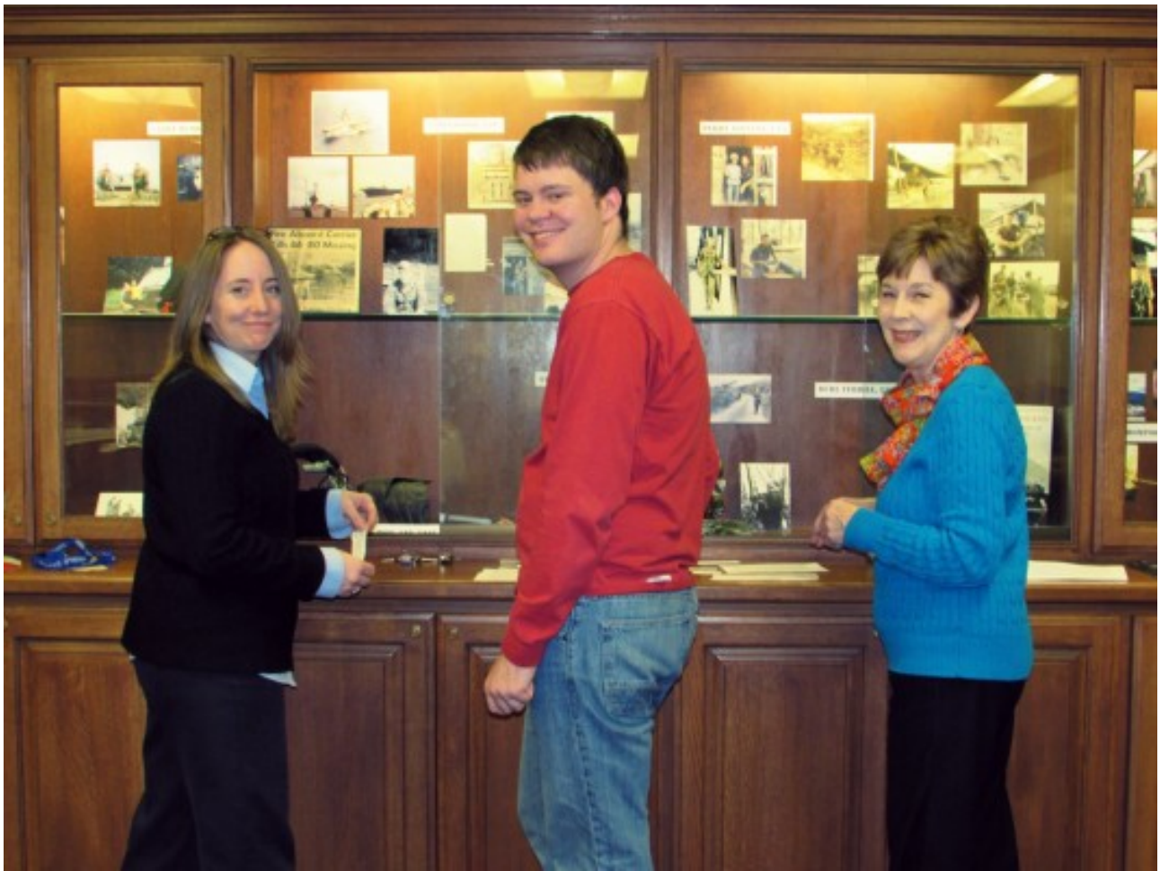
Figure 2: West Texas Collection staff preparing the display for the November 17 opening of “Vietnam: Through the Lens”.