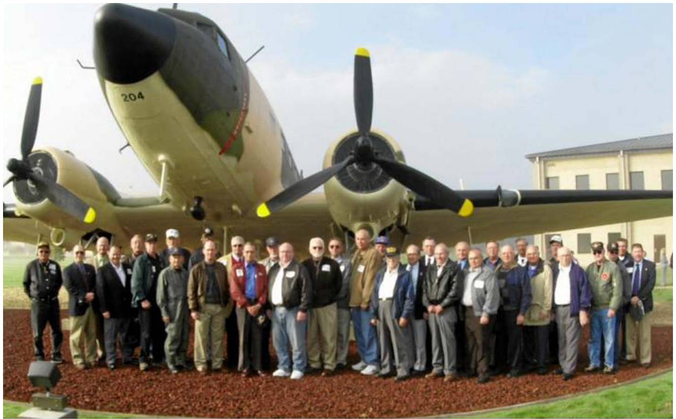
On October 28, 2005, EC-47 crewmembers stand under the newly dedicated aircraft for a group photo.

THE AIRCRAFT ON DISPLAY IS ACTUALLY A C-47A, SERIAL NUMBER 42-108866, BUT PAINTED AND MARKED TO DEPICT AN EC-47Q, SERIAL NUMBER 43-15204 ASSIGNED TO THE 361ST TEWS AND 6994TH SS IN SOUTHEAST ASIA DURING 1974.