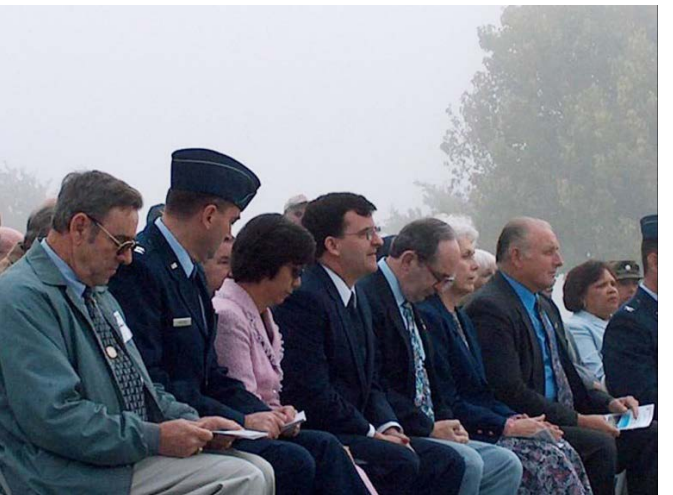
Figure 7: EC-47 ARDF Vietnam Veterans and family members