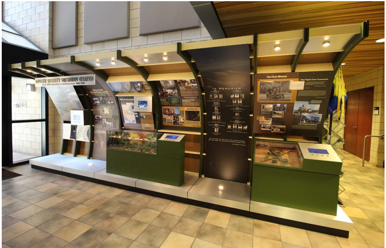
Figure 2: The ARDF History Exhibit features the CAP-72 wreckage fragments in the center showcase and four multimedia monitors with sixteen individual slideshows containing hundreds of photographs, documents and certificates provided by Vietnam ARDF veterans.