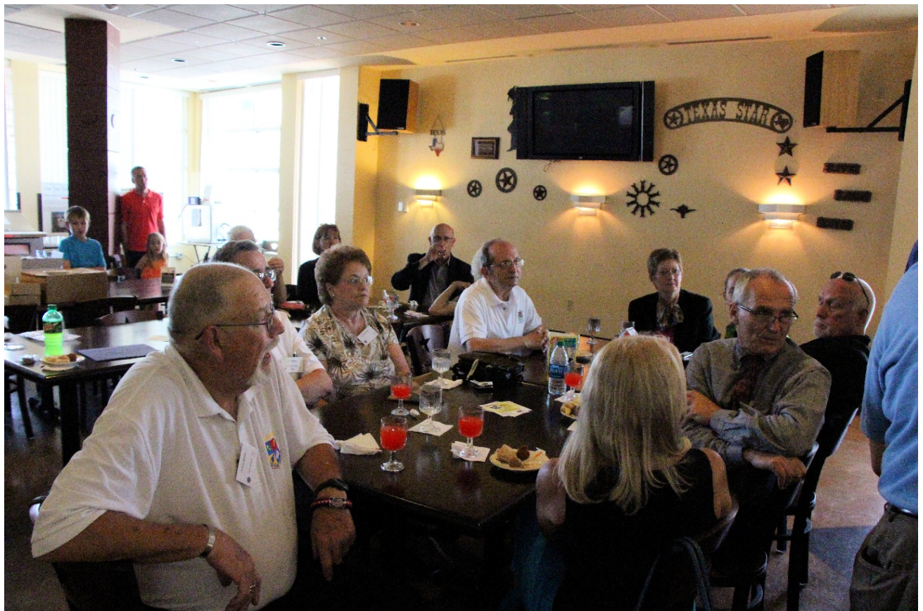
Figure 3: Vietnam ARDF veterans and their families enjoy a reception hosted by the Heritage Chapter, Freedom Through Vigilance Association – July 25, 2014