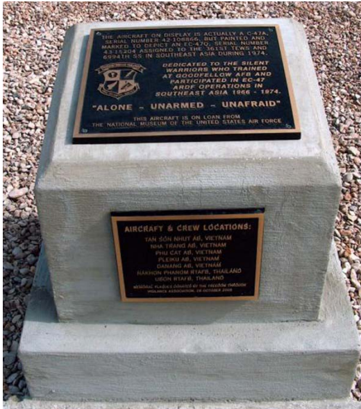
Figure 2: Display Dedication Monument