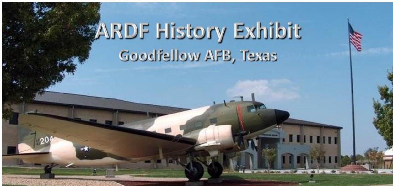
Figure 1: EC-47 ARDF Aircraft Static Display, Goodfellow AFB, San Angelo, Texas. Dedicated on October 28, 2005