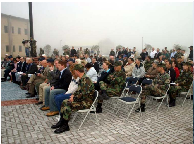
Figure 6: Ceremony officials and Vietnam Veterans & guests