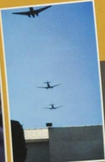
LEFT: EC-47s fly the "Missing Man" route formation during memorial service for the Tide 86 crew at Nha Trang - May 15, 1967