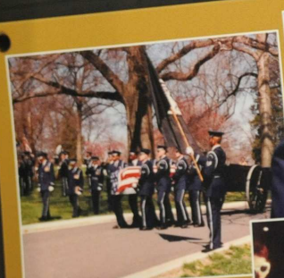
ABOVE: The casket for the fallen is carried to its final resting site.

Activated in 1960, Detachment 3 of the 6994th SS was tasked by the U.S. Embassy and Central Intelligence Agency to support the ground forces protecting the Laotian provincial capital of Luang Prabang close to the Plain of Jars...and to locate and identify supporting forces using the Ho Chi Minh Trail to move troops and supplies through the Bolaven Plateau and into Cambodia.