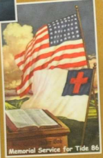
Memorial Service for Tide 86