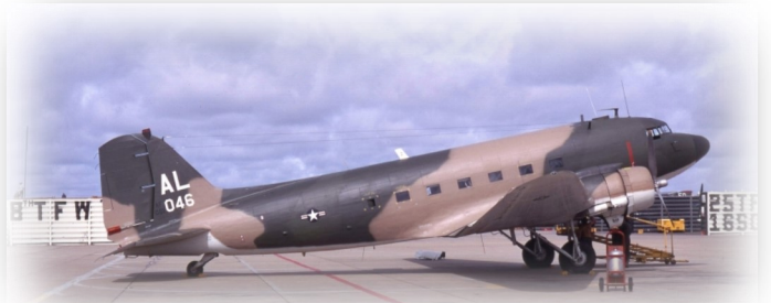
A pristine EC-47P (45-1046) of the 361st TEWS on the Phu Cat Ramp.